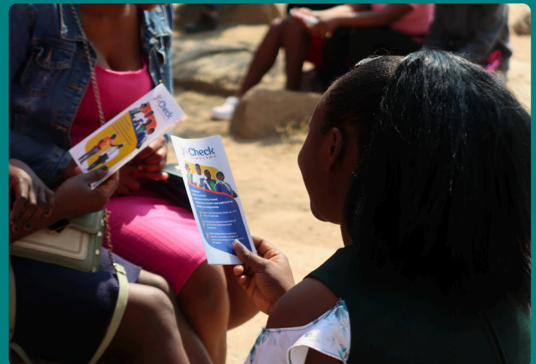
Participatory advisory board members share thoughts on community engagement