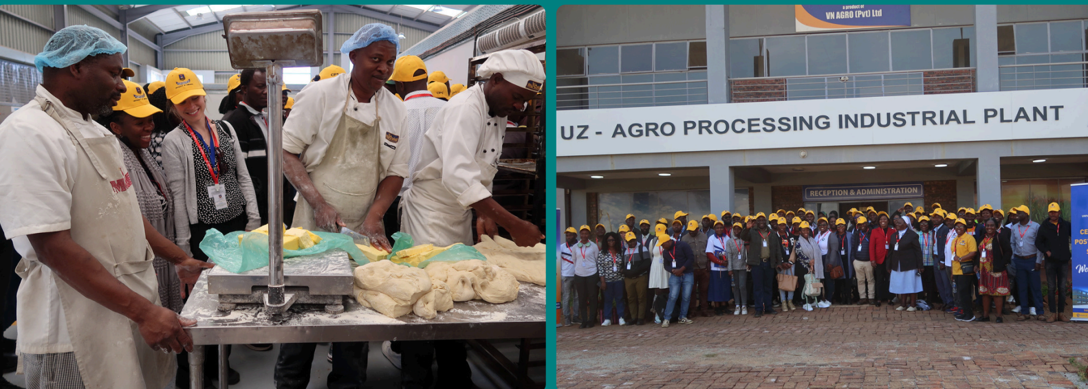
Stakeholders at the UZ -Agro processing plant

THRU ZIM appreciates the continued collaboration with the University of Zimbabwe.