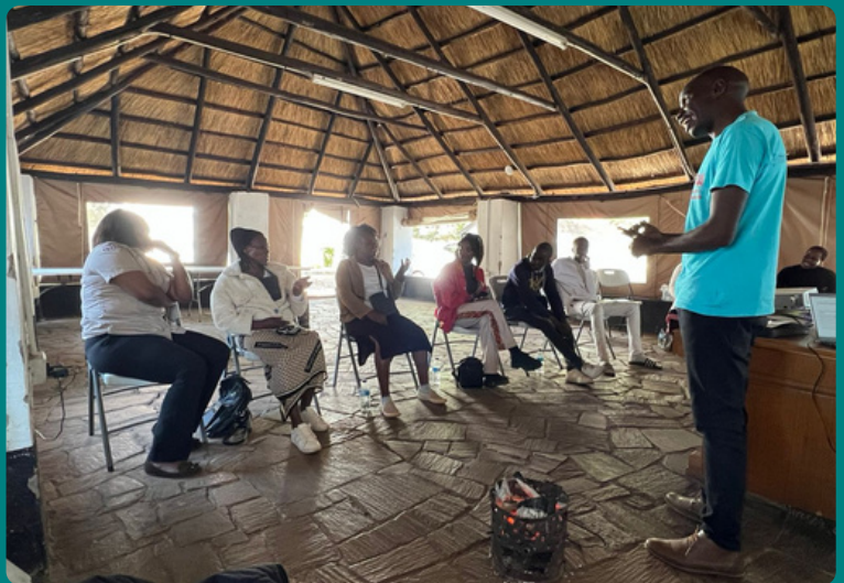
Participatory advisory board members share thoughts on community engagement